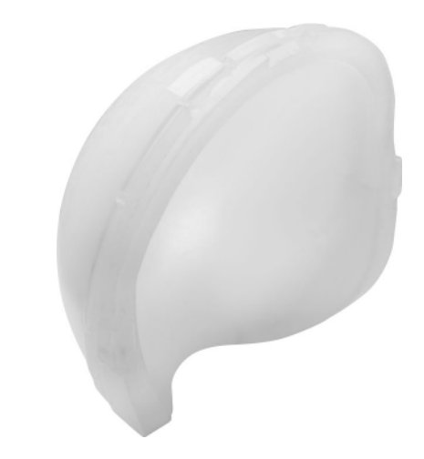
Fig. 2 This is a photograph of a 4-mm-thick cross-linked polyethylene acetabular liner with secure locking tabs and an impingement-free inferior cutout

the width of the femoral neck. The acetabular component is typically used for hip resurfacing and has a larger internal diameter (40–52 mm) than a typical THR (28–36 mm) acetabular component.