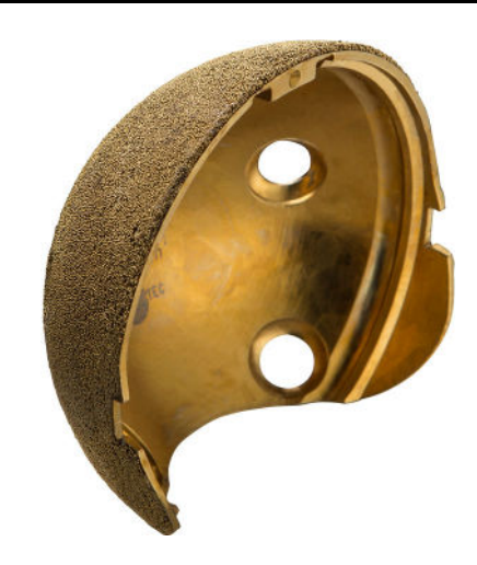
Fig. 1 This photograph shows a porous-coated titanium acetabular shell. The gold color is from titanium nitride (ceramic) coating (color figure online)

The acetabular implant consists of a two-piece, porouscoated acetabular component that offers the opportunity for screw fixation (Fig. 1; FDA 510K-963101). The polyethylene is GUR 1020 (Ticona, Industrial Park Hoechst, Frankfurt am Main, Germany) cross-linked with 7.5 mrad with gamma irradiation, remelted at 155 °F, and sterilized with ethylene oxide (MediTECH-Quadrant, Fort Wayne, IN). The polyethylene thickness is 4 mm (Fig. 2). This acetabular component is approximately 10 mm larger than