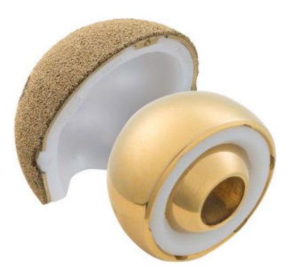
Fig. 3 This photograph shows a double-assembly femoral bearing. The outer bearing is ceramic-coated titanium with a self-centering inner bearing. Any suitable femoral head can be attached to a femoral stem of choice

Of the 160 patients reviewed in this study, 149 patients selfrated their THR and answered all four questions at the 2-year postoperative visit (11 patients did not complete all questions of the evaluation). Ninety-eight percent were satisfied with