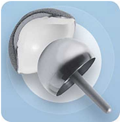
Figure 1 The resurfacing implants used were two-piece acetabular components, consisting of a porous titanium shell and a highly cross-linked polyethylene liner. The components are porous coated.

impede visualization and or require a more complex inserter (27). Also, a two-piece implant allows for independent polyethylene exchange and for supplemental screw fixation if necessary.