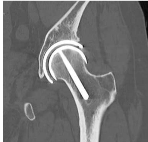
Figure 5 This CT scan shows the bone retention and absence of acetabular wear 11 years following an entirely cementless hip resurfacing arthroplasty.