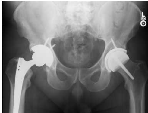
Figure 2 This AP radiograph of a 45-year-old man shows a right total hip replacement and a left hip resurfacing. The same size acetabular shell size was used on each side.

With correct insertion tools, shell insertion and intraoperative liner engagement have been proven safe. Long-term studies including retrieval data have shown that thin components are successful (22,24). It is possible to under-ream the acetabular component by 3 mm and still be able to insert and assemble the two-piece prosthesis