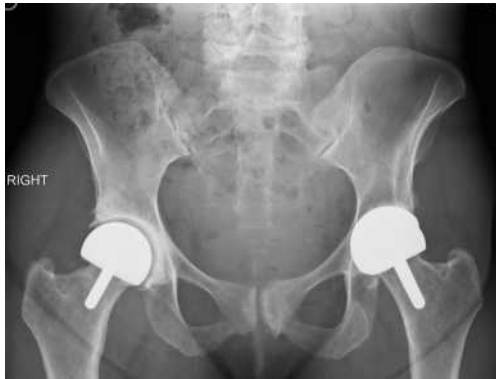
Figure 6 This AP radiograph was taken 15 years following bilateral hip resurfacing arthroplasty in a 61-year-old woman. On the left is a metal-on-metal prosthesis and on the right, there is a cemented (with antibiotics) all polyethylene acetabular component and cemented femoral component placed as a revision for an infected right hip resurfacing prosthesis.

another femoral resurfacing component. In all revisions, the metal-backed acetabular component was retained and the acetabular liner was exchanged to allow use of a smaller or the same highly cross-linked polyethylene. There were five acetabular revisions for loosening. A new shell with screw fixation resulted in a secure component and successful outcome. Using revision for any reason as the endpoint, the Kaplan-Meier survival estimate of mean survivorship was 97.5% (95% CI, 95-98.9%) at 10 years ( Figure 3 ). There were no bearing-surface failures or pending revisions.