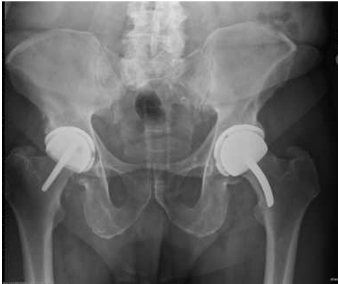
Figure 3 This AP pelvic radiograph of a 72-year-old man is taken 20 years following hip resurfacing using bilateral highly cross-linked polyethylene acetabular components and a cementless Tara left femoral component with a curved stem and a right straight-stem prosthesis.