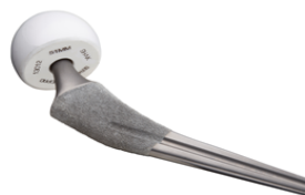
Fig. 2. This femoral prosthesis is used for total hip replacement. The modular femoral head is magnesium-stabilized oxidized zirconium.

The surgical procedure has been described previously 23 . The THRs used a proximally porous wedge-shaped femoral stem. The femoral head was 42 mm - 52 mm in diameter in 2 mm increments for HRA and most THRs. Femoral heads of 32 and 36 mm were also used for THR. The femoral head was either delta ceramic or magnesium-stabilized zirconium (Fig. 2). The femoral head of both the HRA and most THR prostheses reasonably matched the natural femoral head size by intent.