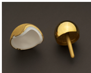
Fig. 1. This photograph of the resurfacing prosthesis shows a two-piece, titanium-backed, highly cross-linked acetabular component and a titanium nitride-coated cementless femoral component.

The resurfacing femoral stem was either Biomet Recap® or Endotec BP™ and was placed from neutral to 15° of valgus relative to the native femoral neck. The femoral component for THRs was the Biomet Taperloc®.