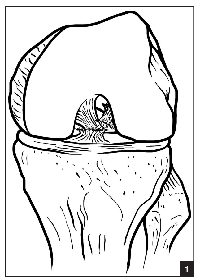
Figure 1. AP view of a knee showing a complete tear of the anterior cruciate ligament. The torn fibers are preserved during the reconstruction.

of the patellar tendon was harvested with bone plugs from the tibial tubercle and patella. Using guides, tunnels were drilled in the tibia and femur, and the graft was advanced and fixed in place with screws.